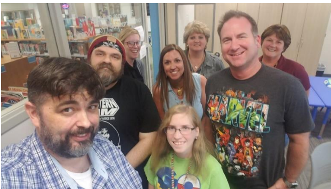
Nerd Con Planning Committee