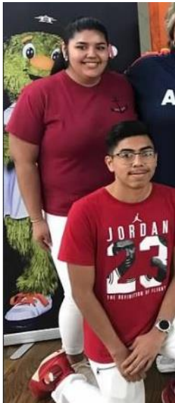
Summer help at Anahuac