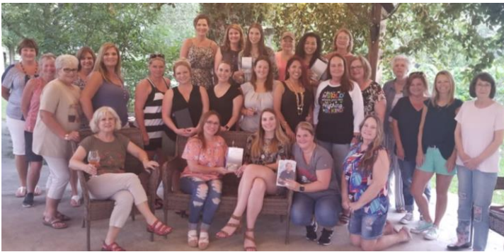
Cork Dork Book Club at Yepez Winery