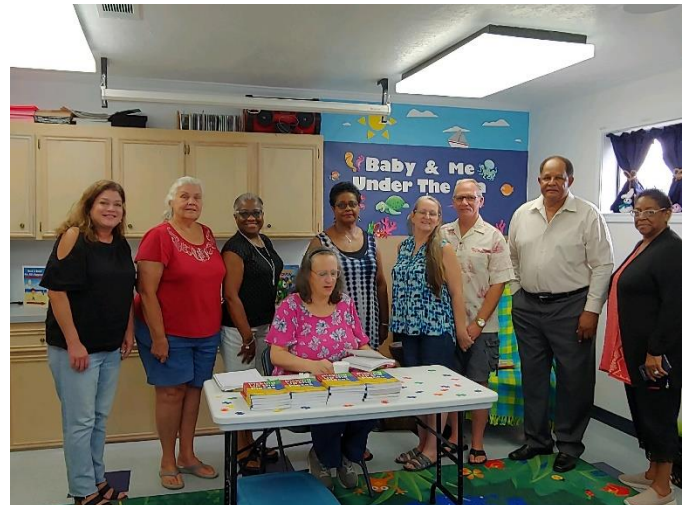
Book signing at Winnie