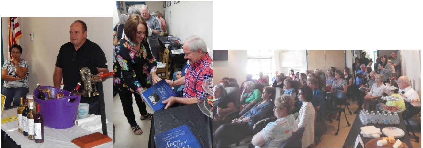
Images from the Local History, Local Wine program in Anahuac