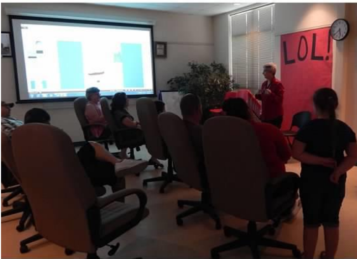
LOL Comedy night at Anahuac