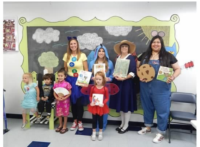
Juanita Hargraves Memorial Branch staff dressed up for Character day!