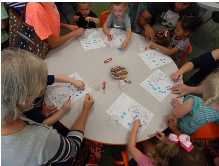
Rain, rain, go away storytime at Mont Belvieu