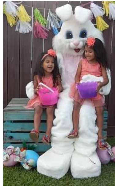
The Easter Bunny visits Anahuac!